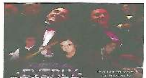
NOVEMBER 17th EARLYBIRDS DINNER "EVERLY BROTHERS & FRIENDS" £27