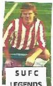
SUFC LEGENDS FRIDAY 27th JULY